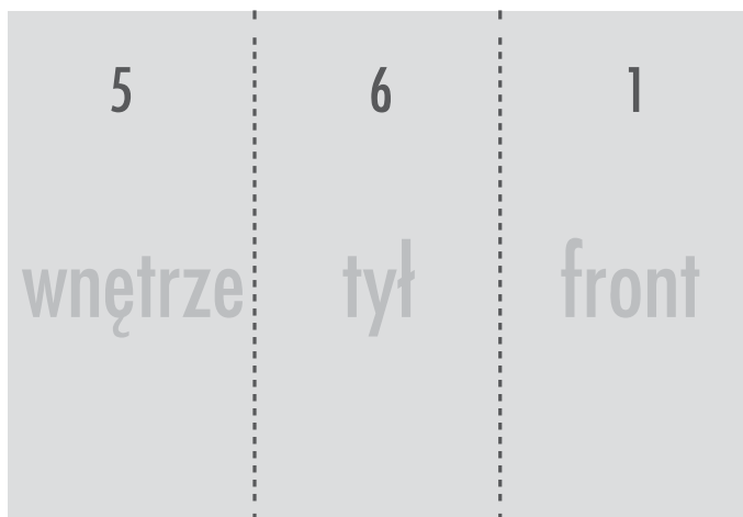
Tak wygląda ulotka przed składaniem - 1 str.