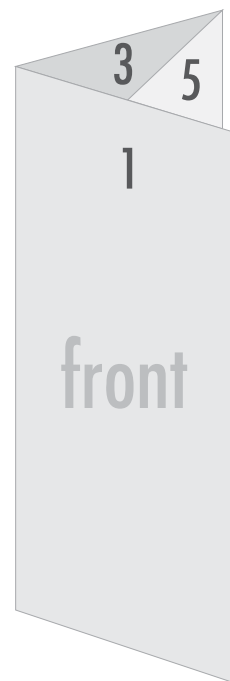
Tak wygląda ulotka złożona na 3 w C