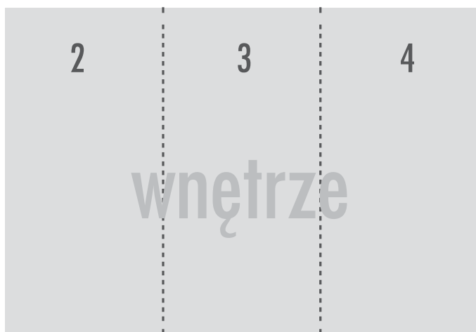
Tak wygląda ulotka przed składaniem 2 str